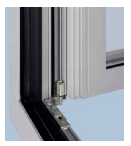
No danger of catching your fingers! The narrow gap on the hinge-side reduces the risk of catching your fingers

Various adjustment possibilities Straightforward lateral and height adjustment on the corner hinge