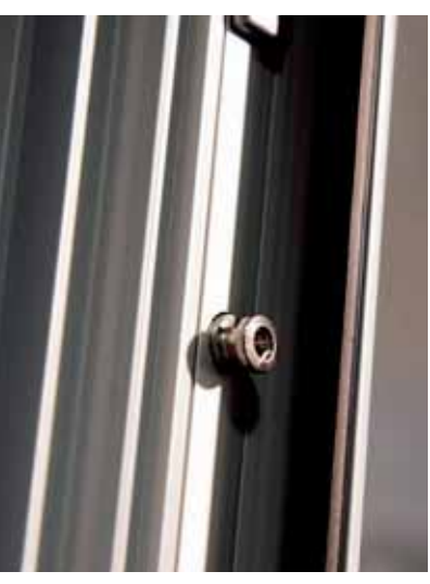
High level of security for Burglary Resistance Grade 2 by means of adjustable security cams

Large sashes or soundproofed glass surfaces are aesthetically beautiful, but they are also heavy. Sash weights of over 100 kg are not uncommon. Unobtrusive hardware is therefore in demand for these "elegant heavyweights". The solution: Roto AluVision T600 - the completely concealed hardware system for large and heavy aluminium windows up to 130 kg. Your advantage: only one additional special component (also invisible from the outside), is enough to achieve the highest weight stability in conjunction with the standard hardware.