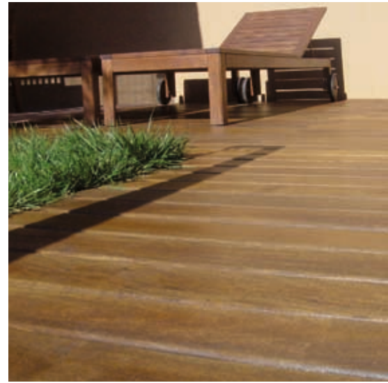
Protection of outdoor wood with Cetol WF 771