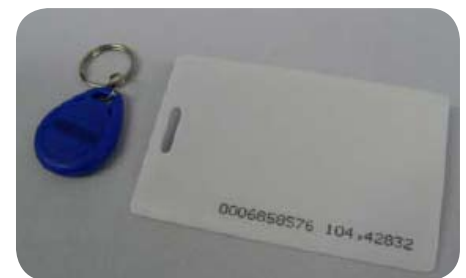
TAG & 26-Bit EM Card