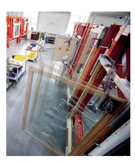
20,000 tilt cycles and up to 30,000 turn cycles: the most important NT components are tested beyond the current standards and quidelines.

To maintain NT quality standards raw material is pre-checked on receipt. If it passes this test, further checks are carried out at regular intervals in the running production. Naturally every component is tested in accordance with the current standards and regulations. NT quality withstands daily corrosion tests, exceeding up to four times the required regulations.